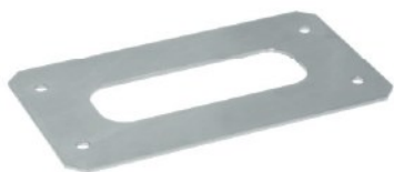
Foundation plate with anchor bolts included. Motor and floor fixing distance 269 mm x 106 mm, no. 4 Ø 12 mm.