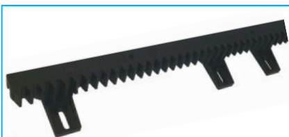
The HD heavy duty steel reinforced rack is supplied in 1m lengths 6 point fixing (legs down)