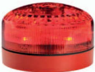
Stock Code: 584061

Multi-function electronic sounder or sounder with red LED beacon combination