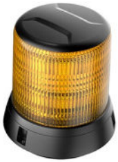
Stock Code: 584056

The Safe Pass amber high profile beacon is designed to get attention. With bright colour, intensity, and flashing rate it strongly delivers a sense of emergency.