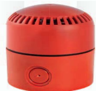
Stock Code: 5840614

The flashing strobe light can be wired together or independent from the sounder enabling the sounder to be turned off while the flashing light remains activated. This keeps the alarm state present without the noise of a prolonged audible alarm.