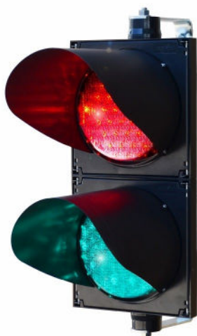
200mm Red / Green Traffic Light

100mm and 200mm red/green traffic lights