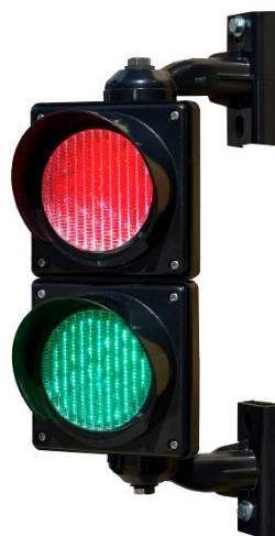
100mm Red / Green Traffic Light

Standard traffic lights that are used on Australian roads are all normally 200 mm in diameter. These obviously need to be visible at distances of up to 300 metres.