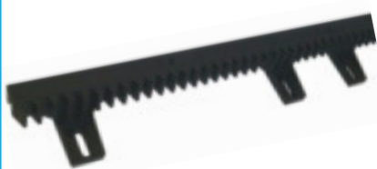
The HD heavy duty steel reinforced rack is supplied in 1m lengths 6 point fixing (legs down)