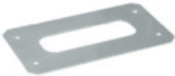
Foundation plate with anchor bolts included. Motor and floor fixing distance 269 mm x 106 mm, no. 4 Ø 12 mm.