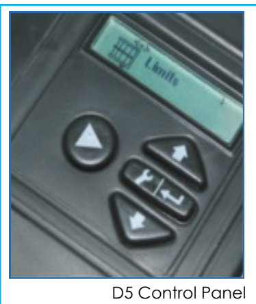
D5 Control Panel

The diagnostic LCD display aids fault finding while the control panel monitors safety circuits to ensure correct and safe operation of the gate operator.