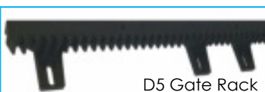
D5 Gate Rack