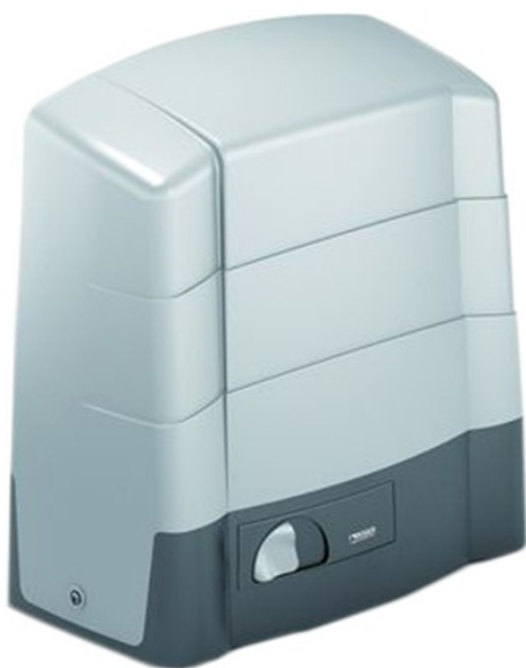
BG30/1804/HS for sliding gates up to 1800 kg BG30/2204 for sliding gates up to 2200 kg

Industrial operators, low voltage, 100% duty cycle for gates up to 2200 kgs