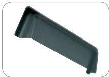
WC/BL Black weather cover