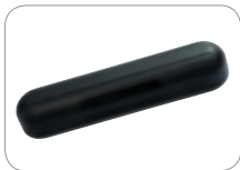
SSR-3-COV/BL Black sensor cover SSR-3-COV/S Silver sensor cover