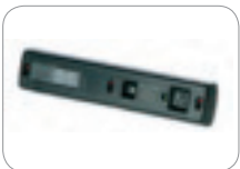
BF-1 Spot-finder installation tool