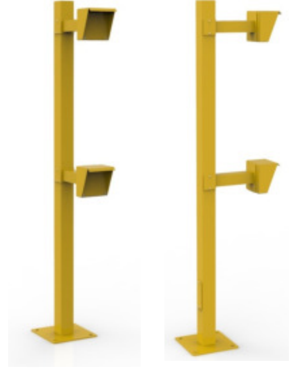
Dual height with square mounting boxes

Mounting boxes can be positioned up and down the post to accommodate truck, car or other traffic.