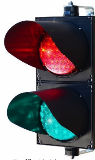
200 mm Red / Green Traffic Light

In some circumstances a smaller traffic light with a narrower viewing angle and a lower light intensity is required. The 100 mm diameter is ideal for this application.