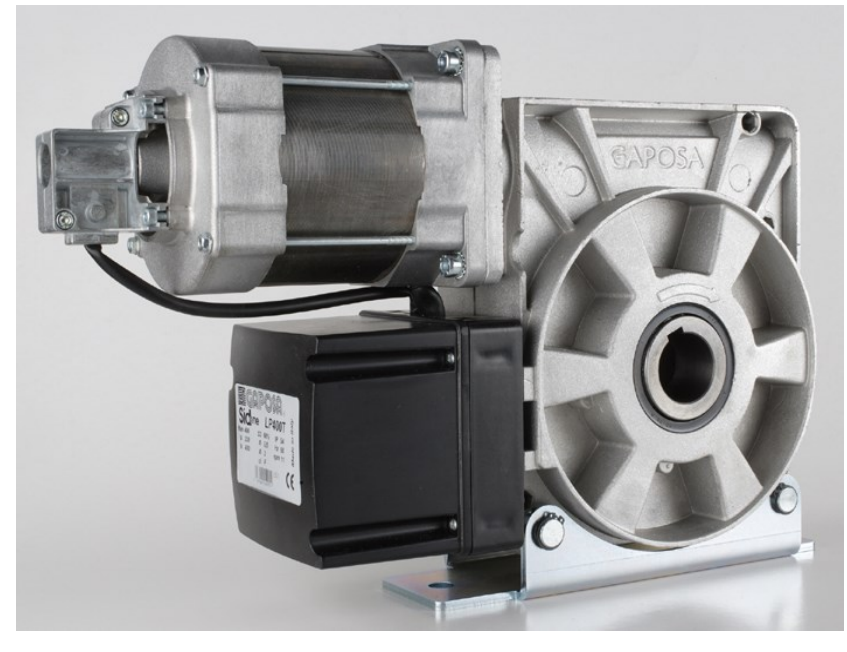
(Above) LP400 to LP 650 with inbuilt safety brake, hand crank, and mounting feet.

Shaft mounted for unbalanced doors, 3 phase and 1 phase