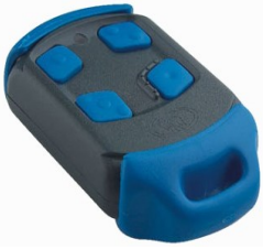
Available in 1, 2 & 4 button