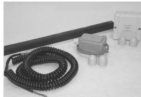
Pneumatic Safety Edge 3m Part # 89454 4m Part # 89455 5m Part # 89456 6m Part # 89457