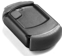
ST 1 Button Transmitter Part #100