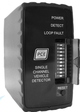
LD100 Loop Detector Part #302