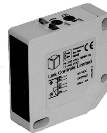
PC50 Reflective PE beam Part #8901